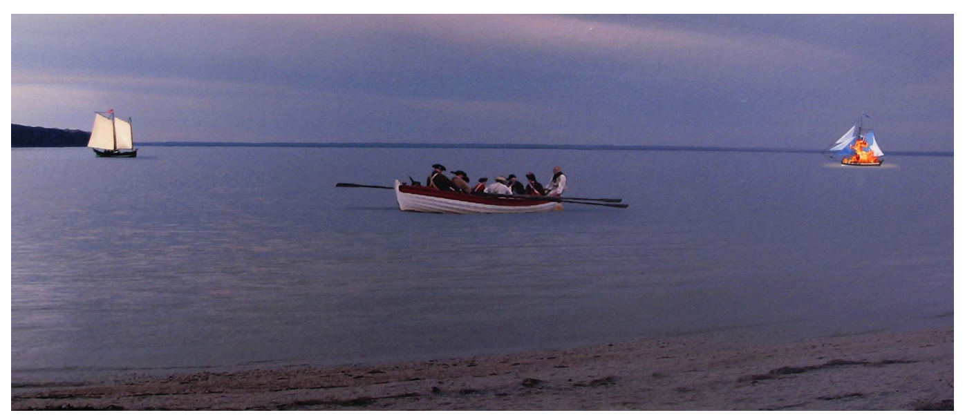
Caleb Brewster often traveled across Long Island Sound with two or more whaleboats, carrying messages and attacking British and Loyalist shipping. The whaleboats were equipped with sails as well as oars and a bow mounted canon. The soldier/seamen carried muskets, pistols, knives and boarding equipment. Caleb Brewster & whaleboat, TVHS SPIES! Exhibit - Re-enactment group in 3/4 scale offshore whaleboat.

Graves with six ships of the line and is joined by three more our of New York, also one of 50 and two of 40 guns and has sailed for Rhode Island and is supposed they will be there before this can possibly reach you. Also 8000 Troops are this day embarking at Whitestone for the before mentioned port. I am told for certain that the French have only seven sail of the line. I greatly fear their destination. We hourly expect a number of the enemy in this quarter, for what end I know not. You must excuse all imperfections at this time on the account of my before mentioned fever. Nevertheless you have perhaps all the needful--and pray for your success and exertions. And am yours sincerely, SAML. CULPER."