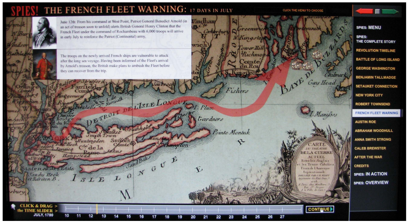
SPIES! Exhibit Computer Program details the story of the French Fleet Warning and Benedict Arnold's traitorous actions

Washington had no way of knowing, but the very same day he wrote to Tallmadge, the large French naval force with 5000 troops under Count de Rochambeau arrived in Newport, Rhode Island. Intelligence on the movements of the British Army in New York was now critical to Washington. At this same time, British reinforcements under Admiral Graves were arriving in New York. The target was the French troops the British knew were headed for New England to support Washington.