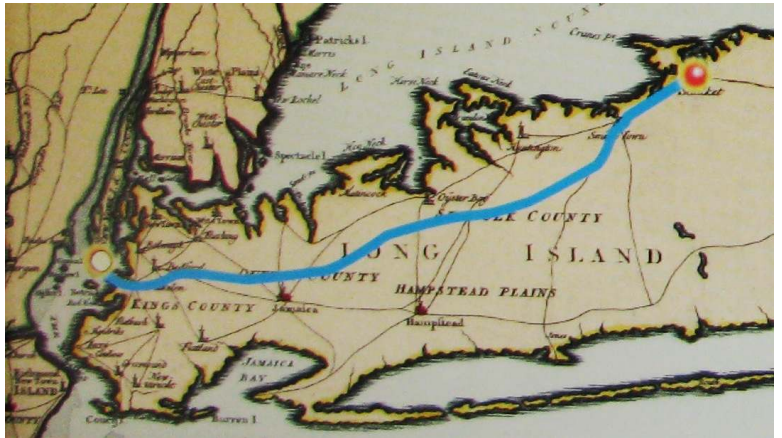
Culper Spy Route of Intelligence from Manhattan to Setauket. TVHS Exhibit SPIES!

Now Tallmadge had the reasons and the support he needed to set up a network of Patriot spies. During the summer of 1778, Benjamin Tallmadge was able to establish a chain of American spies on Long Island and in New York that not only transmitted information on the strengths and deployment of the British forces in New York, but prevented the British from attacking the French fleet when they arrived in Newport, RI in 1780, and led to the detection of Benedict Arnold's treason. Despite Tallmadge's important role in the formation of the secret service, his duties as field officer of the Second Regiment took most of his time during the summer and fall of 1778.